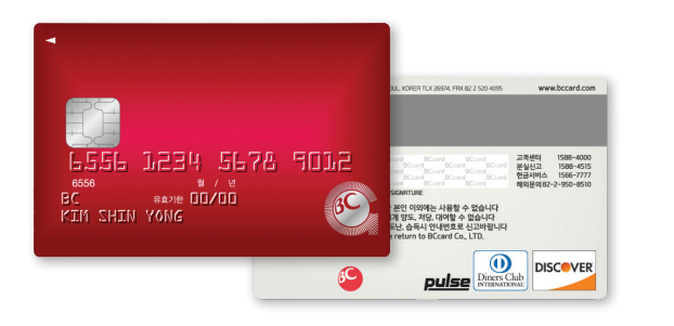
BC Global Card South Korea