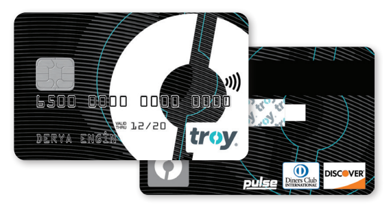
Troy Global Card Turkey