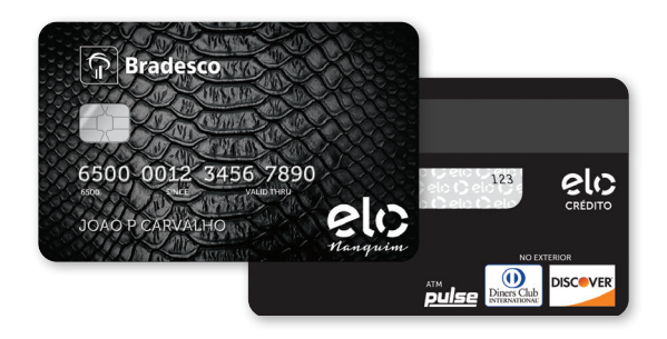
elo Global Card Brazil