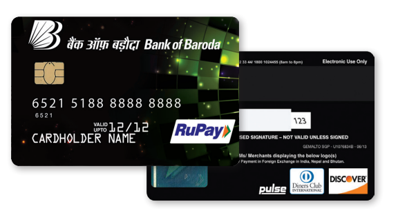
RuPay Global Card India